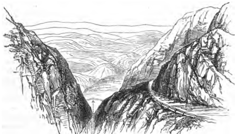
HILLS OF KANSU.

hsien, 243 miles, the hills traversed become more intricate and out of cultivation; they offer, however, no great difficulty to the construction of a line of railway. A tunnel three miles long, chiefly through loess, would be required to connect the valleys of the King-ho and that in which Lung-to-hsien lies. About Kho-ja-pu, 288 miles, the hill terraces ceased to be