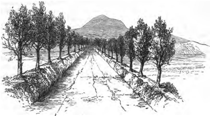
HIGH ROAD IN KANSU.

To the westward of the line Tsin-chau to Lan-chau are the rocky hills separating China from Tibet. Mule-roads are plentiful in them to the vicinity of Chau-i, the residence of a Tibetan prince (Yang); to Labrang Llamasery; to Suin-hwa, in which neighbourhood live Salor Turks; to Bayar Sing, Kunbum Lamasery, &c., all Tibetan localities. The roads to Lhasa viâ Si-ning from Lan-chau, Ping-fang-hsien, and Liang-chau are of importance, as Lhasa is the Mecca of the Buddhist religion, the resort of strangers from the steppes of Central Asia, and where collect Kalmuks, Mongols, Tatars and traders from Ladakh, Kashmir, and Nepal—a centre of communications, the seat of Government, and of the Dalai Lama.