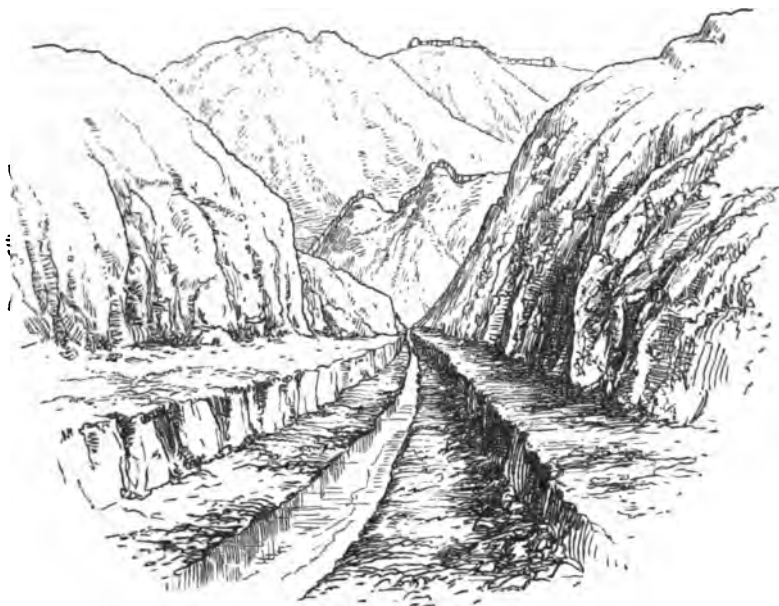
PASS NEAR KULANG-HSIEN; THE GREAT WALL ALONG THE CRESTS OF THE HILLS.

After leaving Lanchau little traffic was met with, and the pigs in the ruined villages were as numerous as the men to be found in the few huts reoccupied by them. A few Chinamen alone occupy the cultivated wedge; coal is abundant and cheap, 200 cash the picul in the Ping-fang