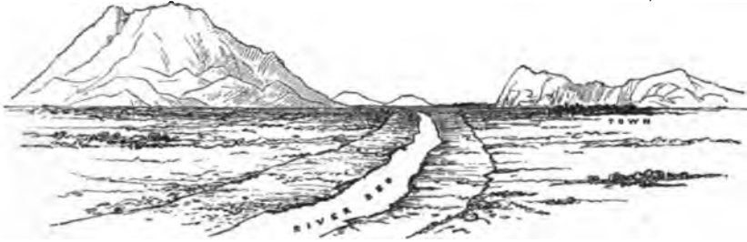
NEIGHBOURHOOD OF URUMTSI.

Hung-Miotza or Urumtsai, is now the capital of the province of Sin-Kiang, the new Chinese frontier province formed to include Kashgaria, Outer Kansu, Ili, Zungaria, &c., and extending to the Russian border